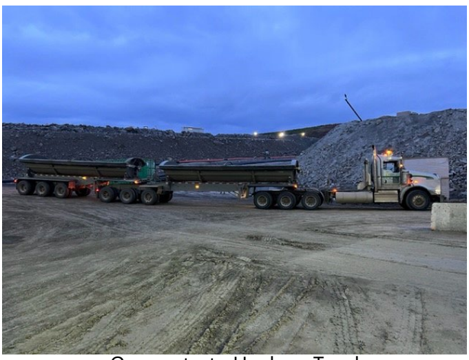
Concentrate Haulage Truck

Both Minto Metals Corp. and Lynden Transport are very cognizant of environmental concerns and take every reasonable precaution to ensure there is no dusting of concentrate while in transit.