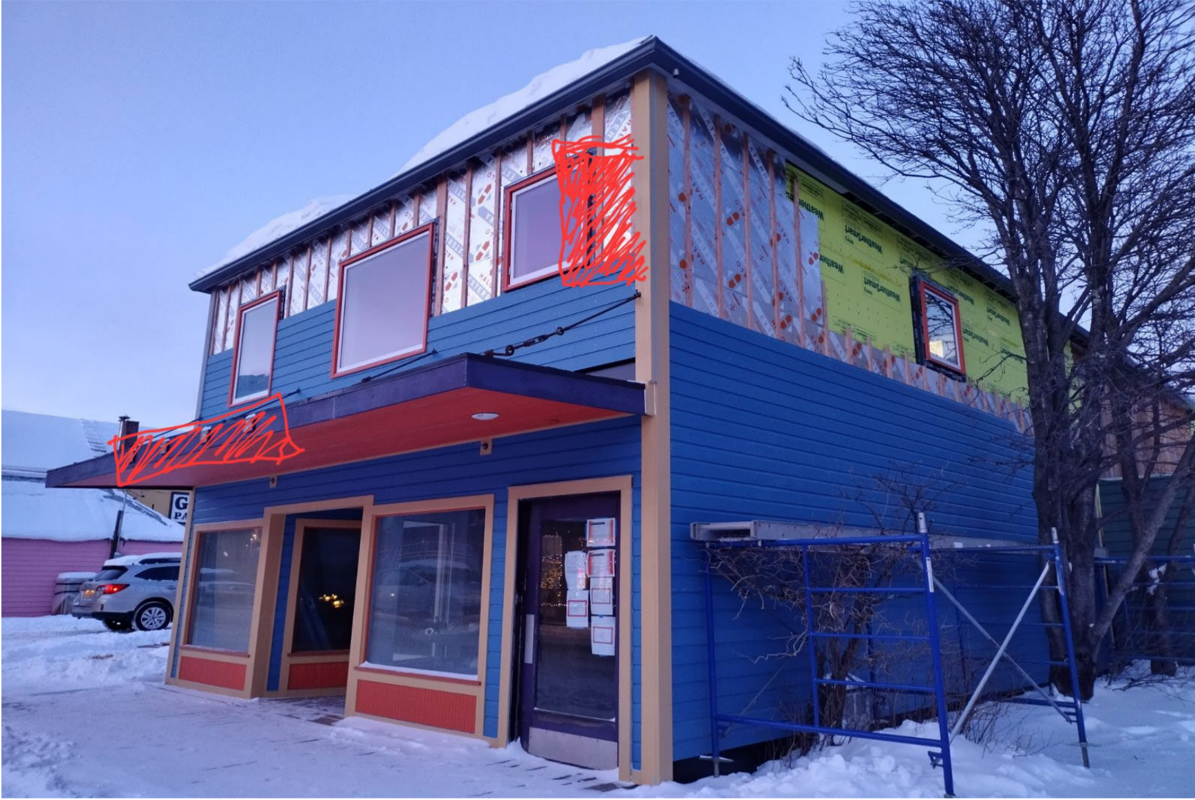
Shows location of both proposed signs, on the awning and the projecting sign.